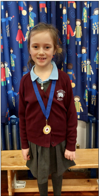
Good Manners Award