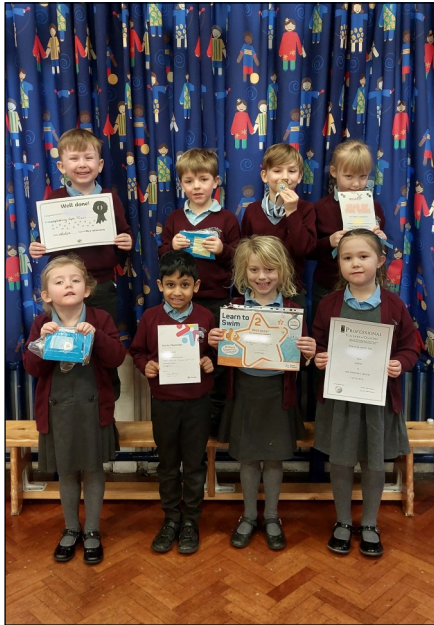
Out of School Success