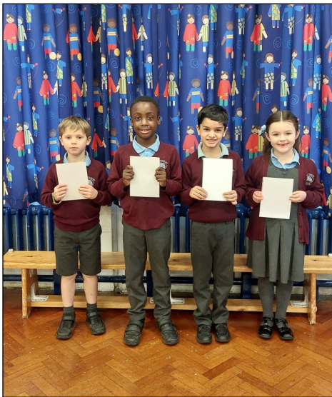
Stars of the Week - Year Two