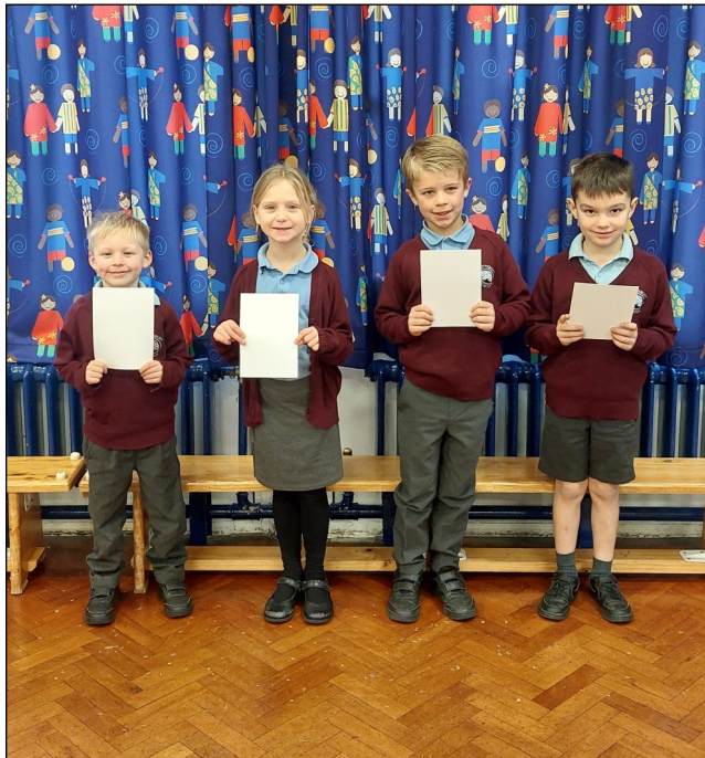
Stars of the Week - Year One