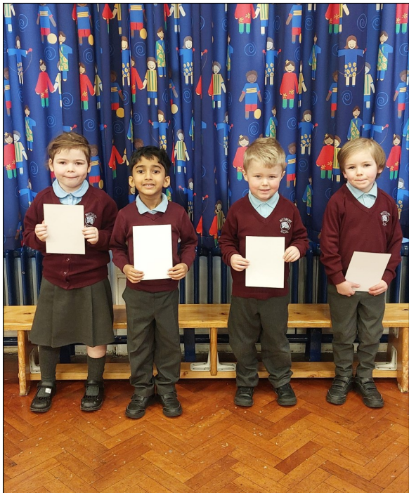
Stars of the Week - EYFS