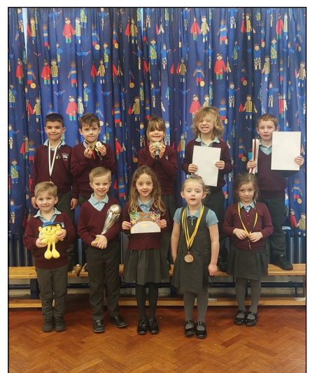
Out of School Success!