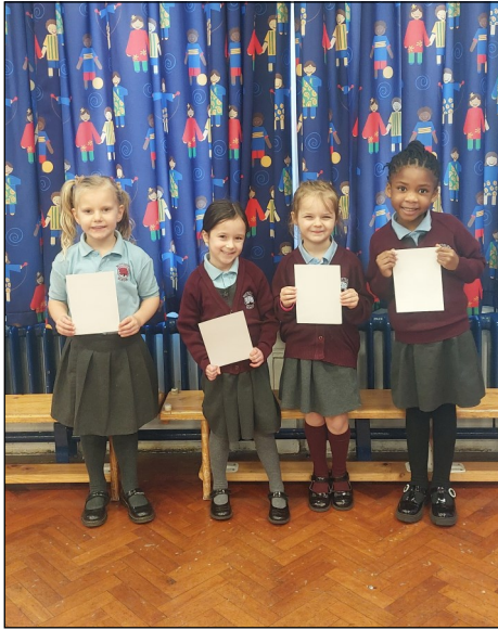
Reception - Stars of the Week