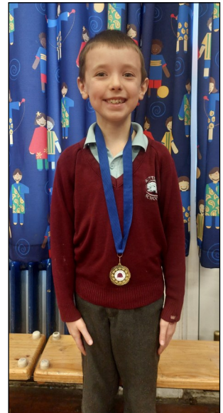
Good Manners Award