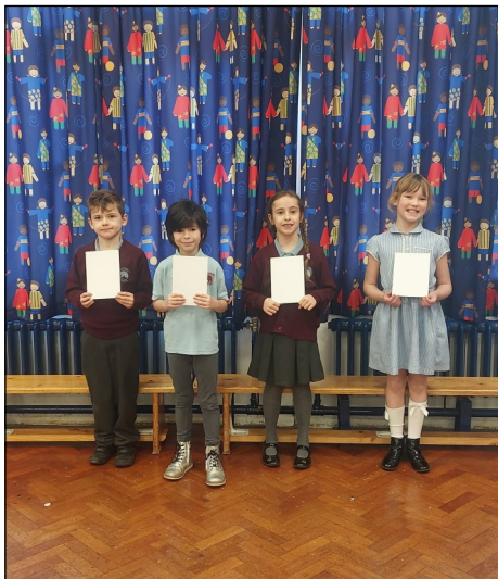
Year Two - Stars of the Week