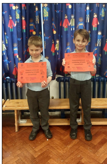
50 Things - 10 Completed!