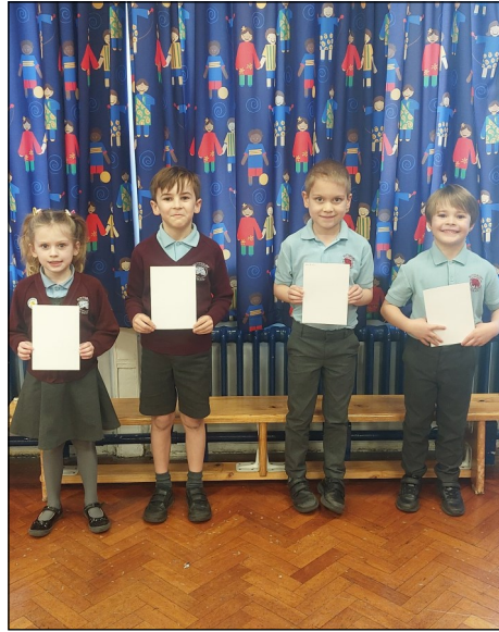
Year One - Stars of the Week